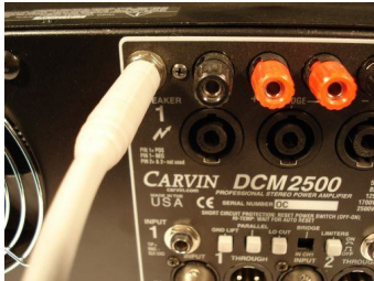
DCM2500 1/4 CH 1