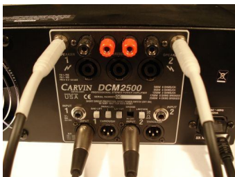
DCM2500 1/4 CH 2